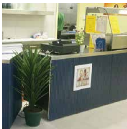
Enclose a bench to create a servery.