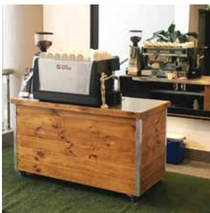
Enclose a bench to create a mobile coffee cart.