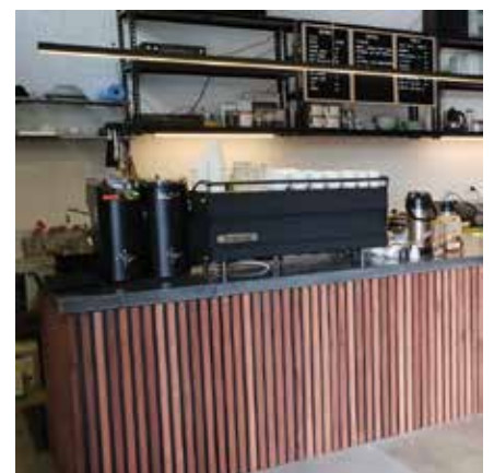
Enclose a bench to create a counter.